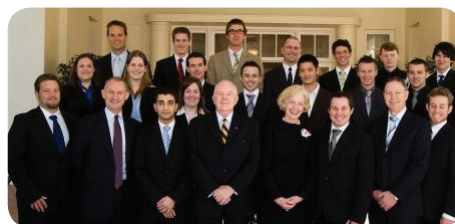
Her Excellency Governor General Quentin Bryce and the TSTL group